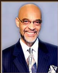
Rev. James Lawson Keynote Speaker